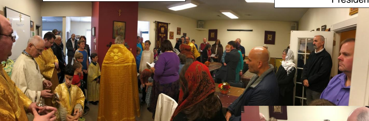
Left – panorama view of St. Michael Slava