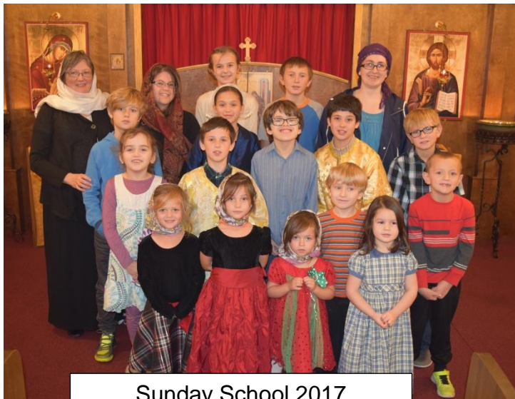
Sunday School 2017