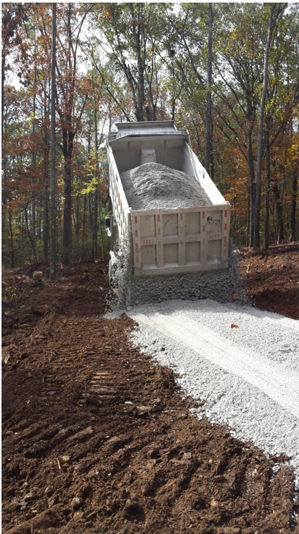
Above gravel laid down on driveway of new Church property