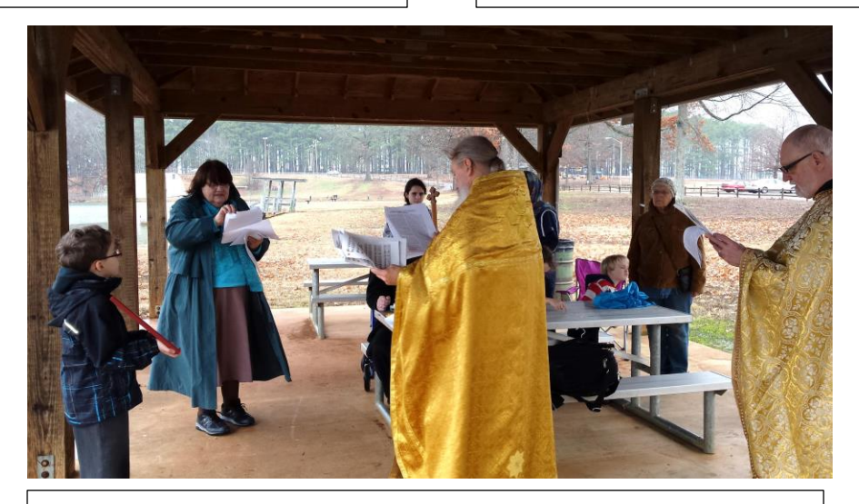
Theophany at Brahan Park (Above) Children's Program reading "Timmy Tiptoes" (Below)