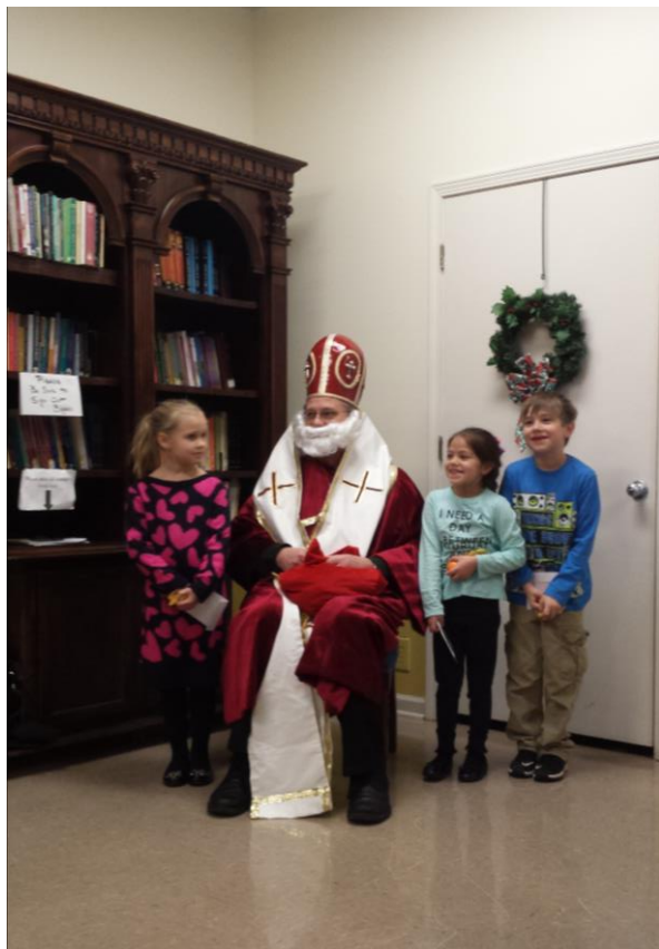
St. Nicholas Visits