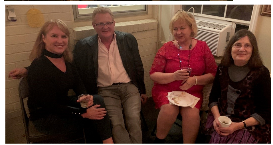
Schultz Annual Christmas Party January 10, 2020