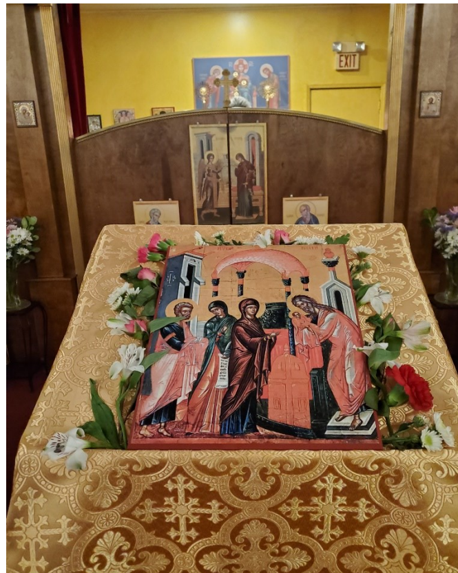
Above: Saturday, March 15—Feast of the Meeting of the Lord