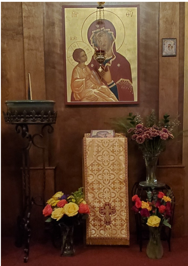
Flowers donated by Anya Freude