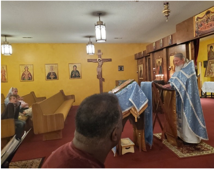
Protection of the Holy Theotokos Monday, October 14