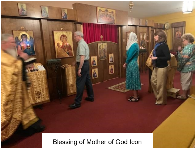
Blessing of Mother of God Icon