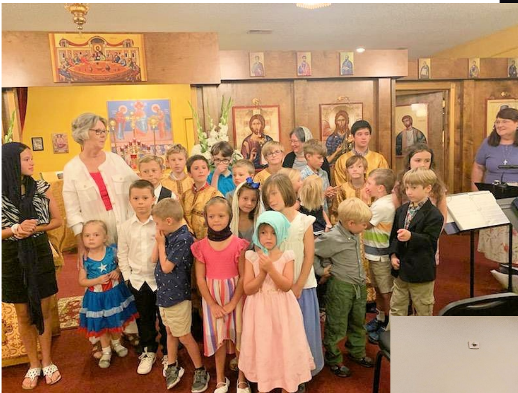
Left: Blessing of school children on Sunday, August 11 and beginning of 2019-20 Church School