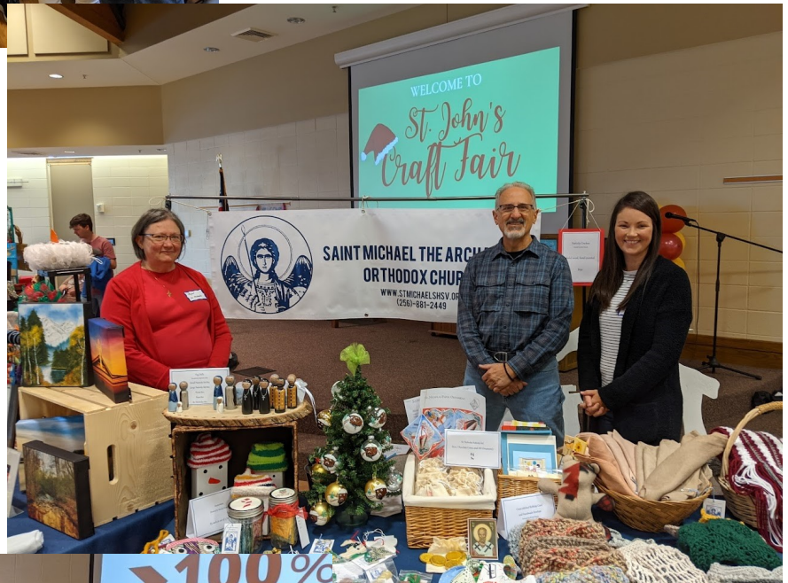
Right & Bottom: Selling homemade crafts at St. John the Baptist Catholic Church on Saturday, November 20, 2021