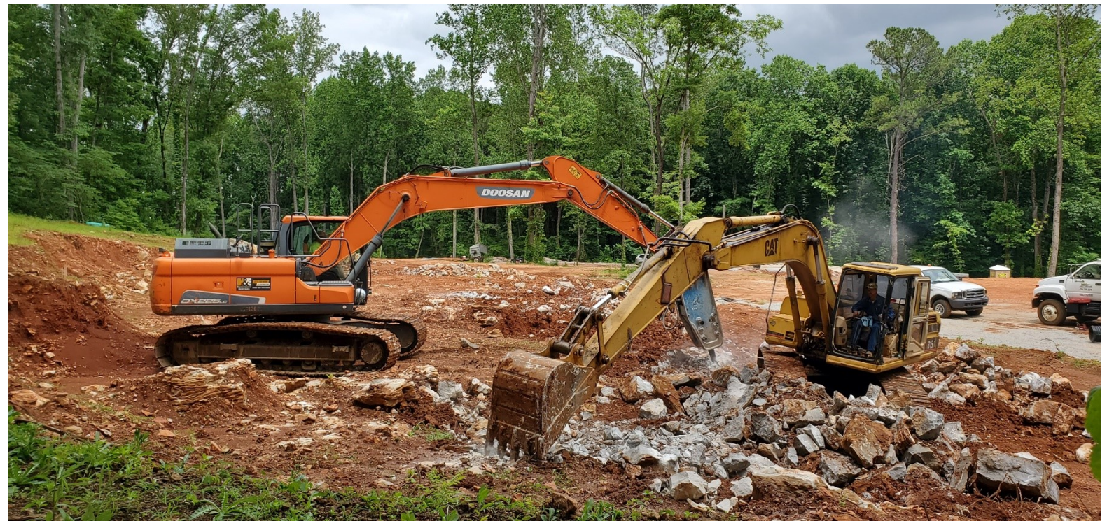
Above: Rock breaking on the new Church property on Madison Blvd.