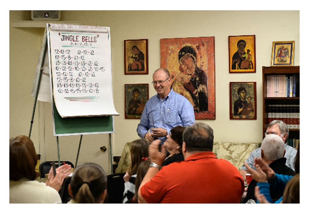
Nativity 2016: This past Nativity was a wonderful celebration of the Birth of our Lord! We had a record attendance for the Nativity Divine Liturgy on January 7<sup>th</sup>. The Christmas Eve service and meal the night before and the annual Schultz Christmas party were also both very well attended with lots of Christmas cheer and fellowship!