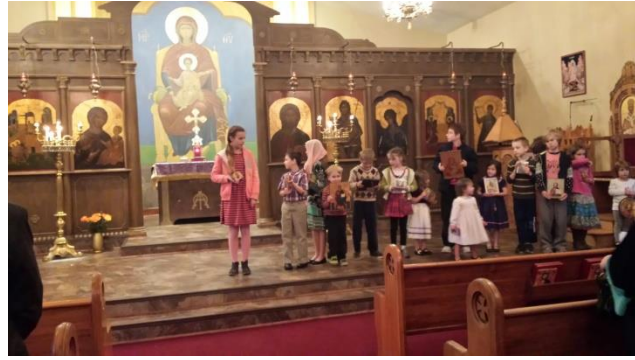
Sunday of Orthodoxy at Holy Cross – St. Constantine & Helen Greek Orthodox Church