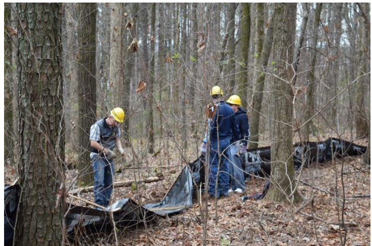
The Silt Fence Crew