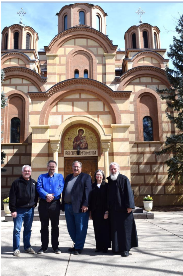
2017 Annual Assembly Delegates