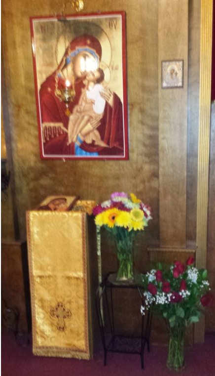
Feast of Ascension