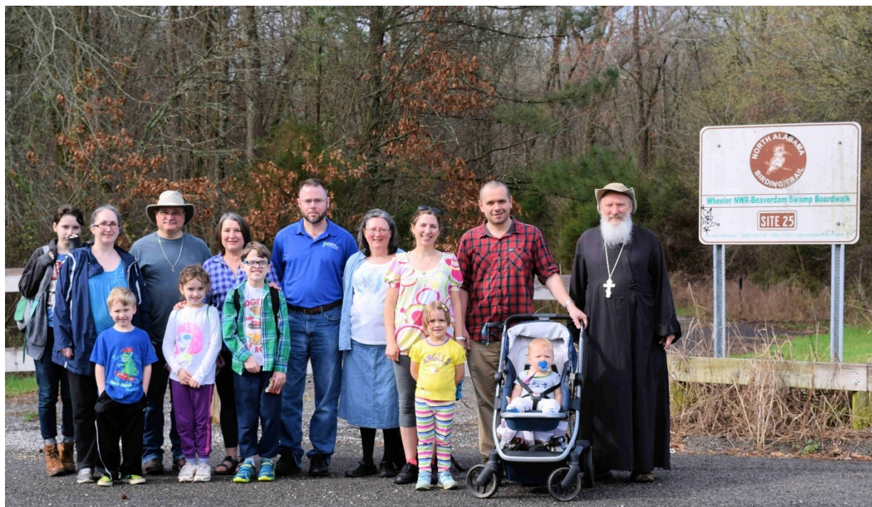
Wheeler Wildlife Refuge Beaverdam Walk (largest tupelo tree grove in Alabama)