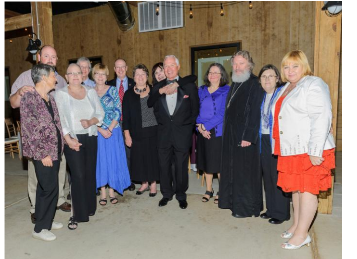
Some familiar faces at the Wedding Reception