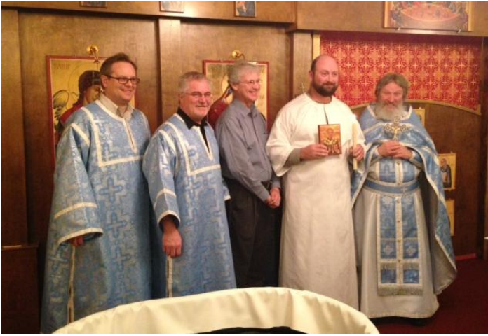
James Taylor's Baptism